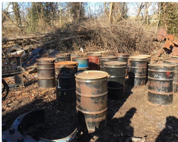
Some of the numerous drums containing hazardous materials found at Graveyard Auto.

The cleanup is important because left uncontained, the waste could not only harm anyone entering the site but eventually move from the location and threaten drinking water and several endangered animal species in the area as well as the Falls of Ohio natural national landmark that is less than a mile from Graveyard Auto.