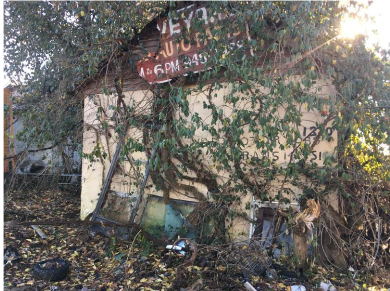
EPA responders found hazardous waste on the overgrown Graveyard Auto site and will conduct a cleanup this spring and summer.

https://response.epa.gov/ graveyardauto .